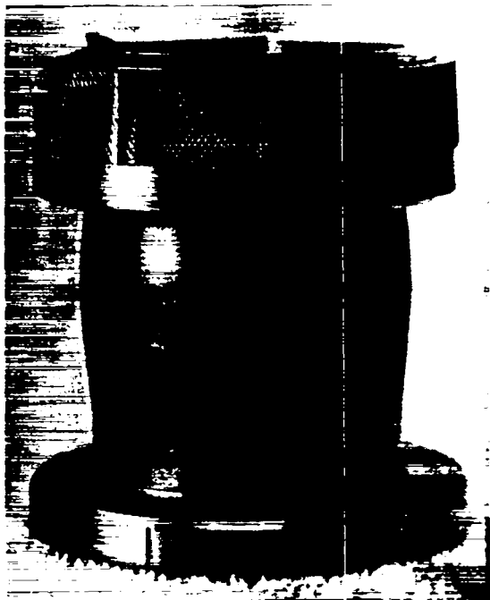
Fig. 3. Stainless Steel Bomb Shell Distorted by Reaction between \text{HNO}_3 and Silicone oil.

A fuel that has been the subject of countless hours of dissolution studies in many laboratories is the HTGR type, consisting of microspheres or beads of U-Th carbide coated with successive layers of pyrolytic carbon, silicon carbide, and pyrolytic carbon. The only successful treatment reported in the literature to date (3) for these fuels involves a series of combustions at 850^\circ\text{C} in oxygen and reaction at 1100^\circ\text{C} in chlorine. A study